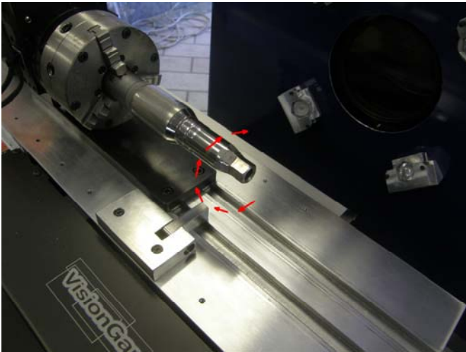
Rotary stage and workholding for turnkey runout measurement application

In this case, the Min/Max tool is used to align the flats on the part perfectly horizontally, completely automatically